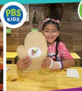
Molly of Denali: An Alaskan Adventure