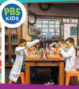
Xavier Riddle and the Secret Museum: The Exhibit