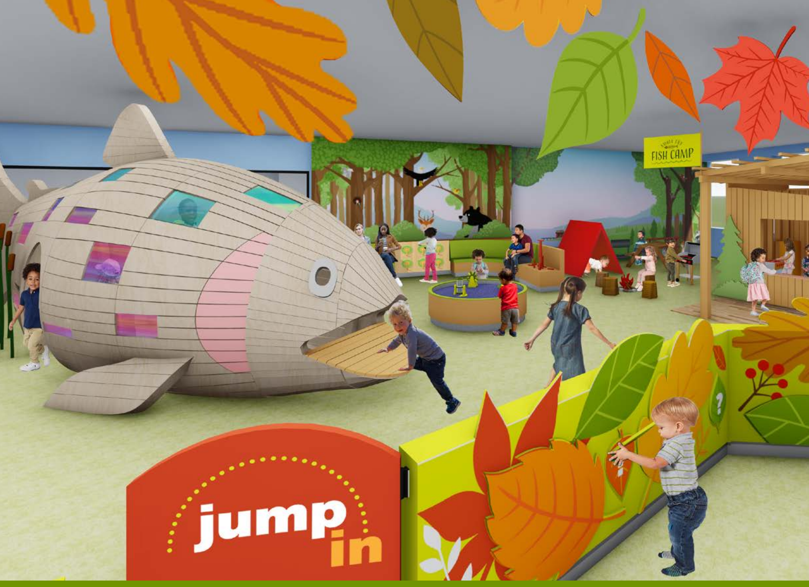
Rendering for the Small Fry Fish Camp at Museum of Discovery, Little Rock