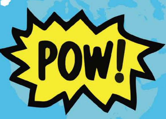
Tunis, Tunisia Workshops

Doseum, San Antonio, TX Explora, Albuquerque, NM Exploratorium, San Francisco, CA Frost Science Museum, Miami, FL Acton Discovery Museum, Acton, MA Great Lakes Science Center, Cleveland, OH Minnesota Children's Museum, St. Paul, MN FIT and Bank Street Graduate Programs, NYC