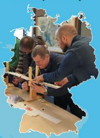
Heilbronn and Nuremberg Germany Workshops

Muzeiko Children's Science Museum Sofia, Bulgaria