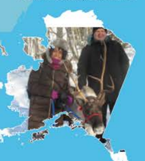
Fairbanks Children's Museum, Fairbanks, Alaska

Doseum, San Antonio, TX Explora, Albuquerque, NM Exploratorium, San Francisco, CA Frost Science Museum, Miami, FL Acton Discovery Museum, Acton, MA Great Lakes Science Center, Cleveland, OH Minnesota Children's Museum, St. Paul, MN FIT and Bank Street Graduate Programs, NYC