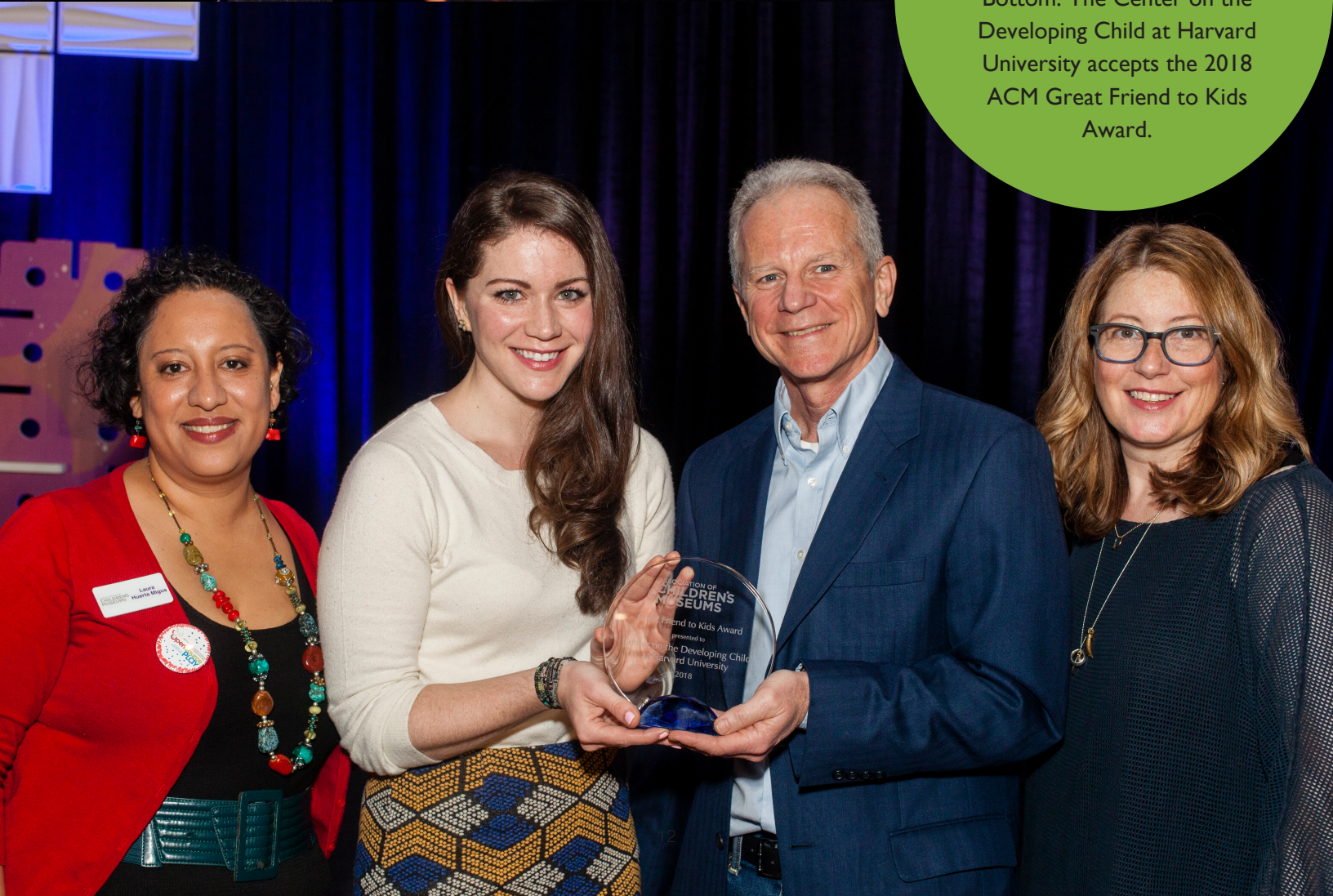
Bottom: The Center on the Developing Child at Harvard University accepts the 2018 ACM Great Friend to Kids Award.