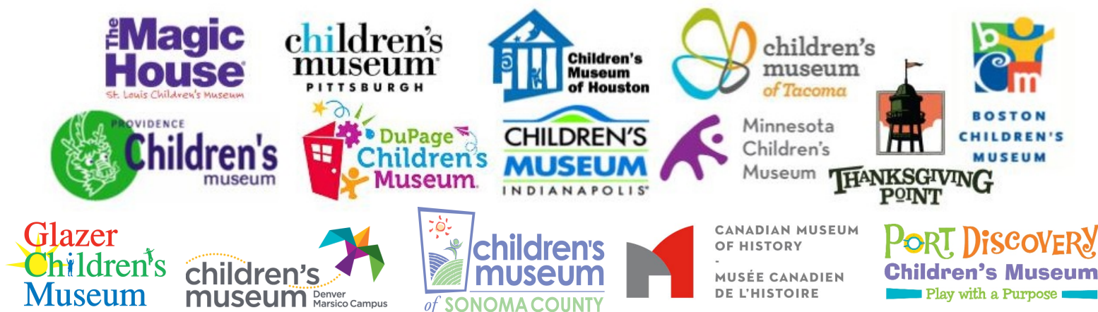
Museums participating in the Children's Museum Research Network

2018 and Beyond: In October 2018, ACM launched the second volume of ACM Trends Reports, with three reports on the economic impact of children's museums, made possible with funding from the Institute of Museum and Library Services. The remainder of the reports in this second volume will be released in FY2019. In 2019, CMRN will share findings from its third research study on caregivers' perceptions of children's learning in children's museums—for the first time approaching a general audience of parents and caregivers. CMRN will continue to work on future research studies along with the sustainability of the network past the grant period.