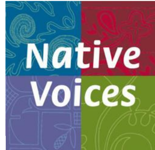
Boston Children's Museum – Native Voices: New England Tribal Families