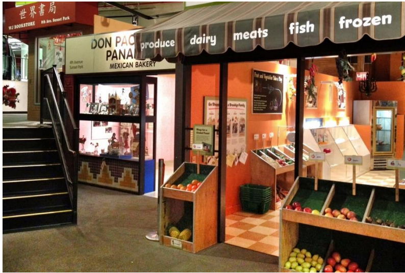
Brooklyn Children's Museum – World Brooklyn